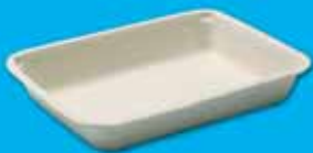
Meditainer Chip A