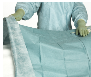
4 Unfold the drape towards patient's feet.