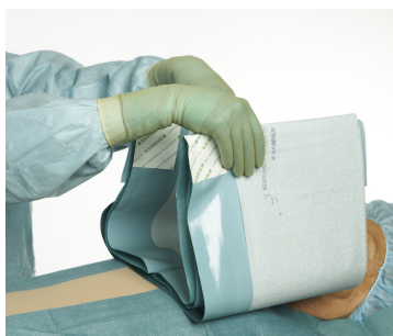
7 Position the adhesive op-sheet in the middle.