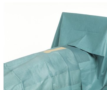
8 Unfold the drape.