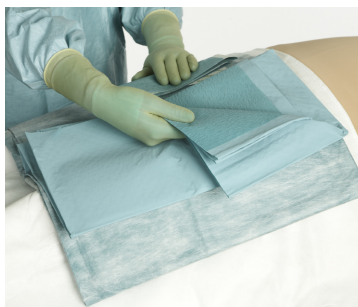
3 Unfold the drape side to side.