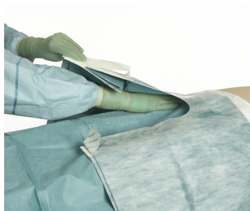
5 Remove the release paper.