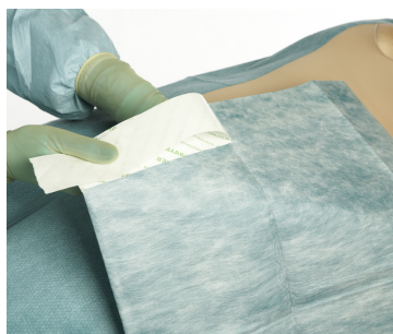
6 Secure adhesive edge one side at a time.