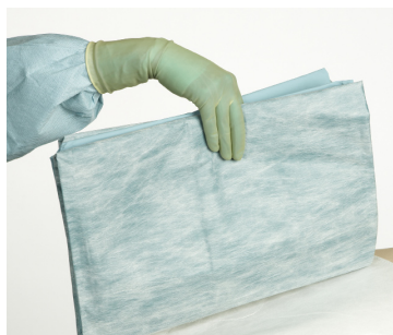
2 Position the split sheet in the middle of the abdominal area.